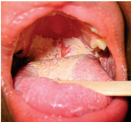
Occupied territory... 'oral thrush' is one of the more clinically obvious manifestations of Candida albicans

There are many factors in our modern society that can upset the ecological balance of the body, weaken the immune system and thus allow the yeast to proliferate. Of these, the major risk fac-